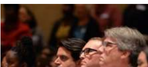
Public debate over LGBT protections persists at council meeting as Jax Chamber