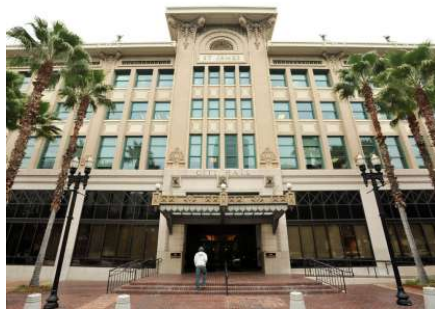
Jacksonville's City Hall