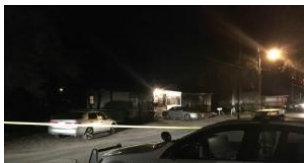
Police: 14-year-old shot in Lake City home invasion